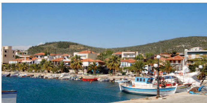
Skala Kallirachi harbour

The Apartments: Self Catering Apartments for 2/3 Air Conditioning Free Wifi