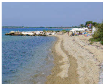
Beach 100m from Second Home