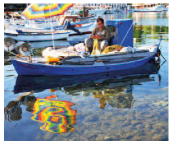
Thassos Town Old Harbour

In our view this is one of the nicest small units in Thassos Town.